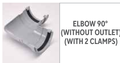
ELBOW 90° (WITHOUT OUTLET) (WITH 2 CLAMPS)