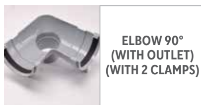
ELBOW 90° (WITH OUTLET) (WITH 2 CLAMPS)