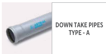
DOWN TAKE PIPES TYPE - A