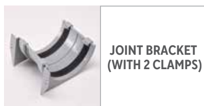
JOINT BRACKET (WITH 2 CLAMPS)