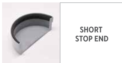
SHORT STOP END