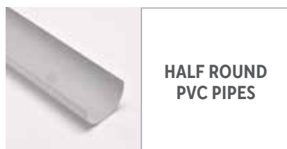
HALF ROUND PVC PIPES