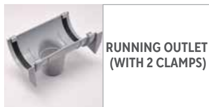
RUNNING OUTLET (WITH 2 CLAMPS)