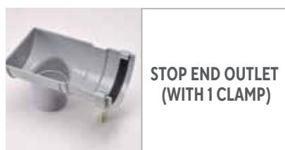
STOP END OUTLET (WITH 1 CLAMP)