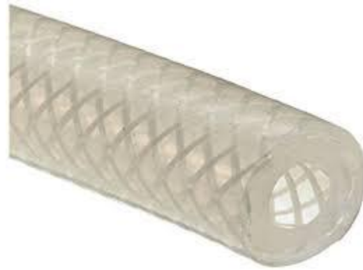
* Nylon Braided Reinforced