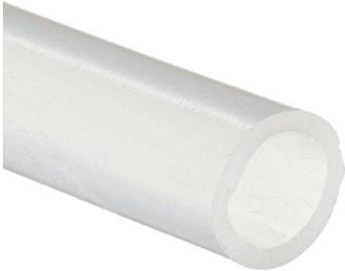
• Plain Type